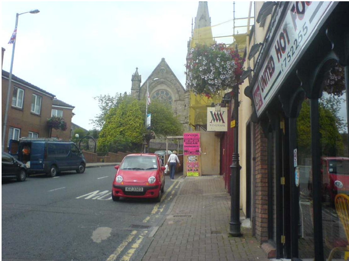
Appendix 4 – Location C. Church Street Dungannon. (Tubes on black lamp post).