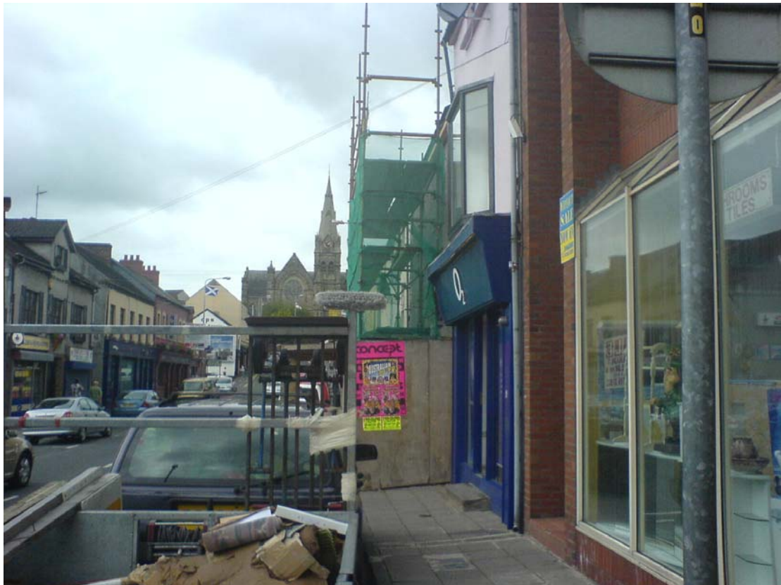
Appendix 2 – Location A. Perry Street Dungannon. (Tubes on drain pipe at O2 Shop)