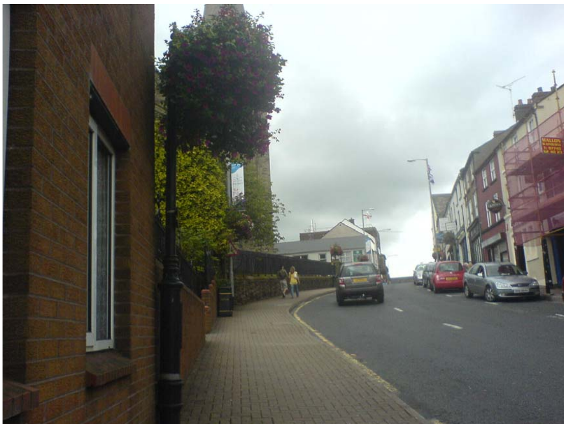
Appendix 5 – Location 5. Existing Church Street Site. (Tubes on lamp post).