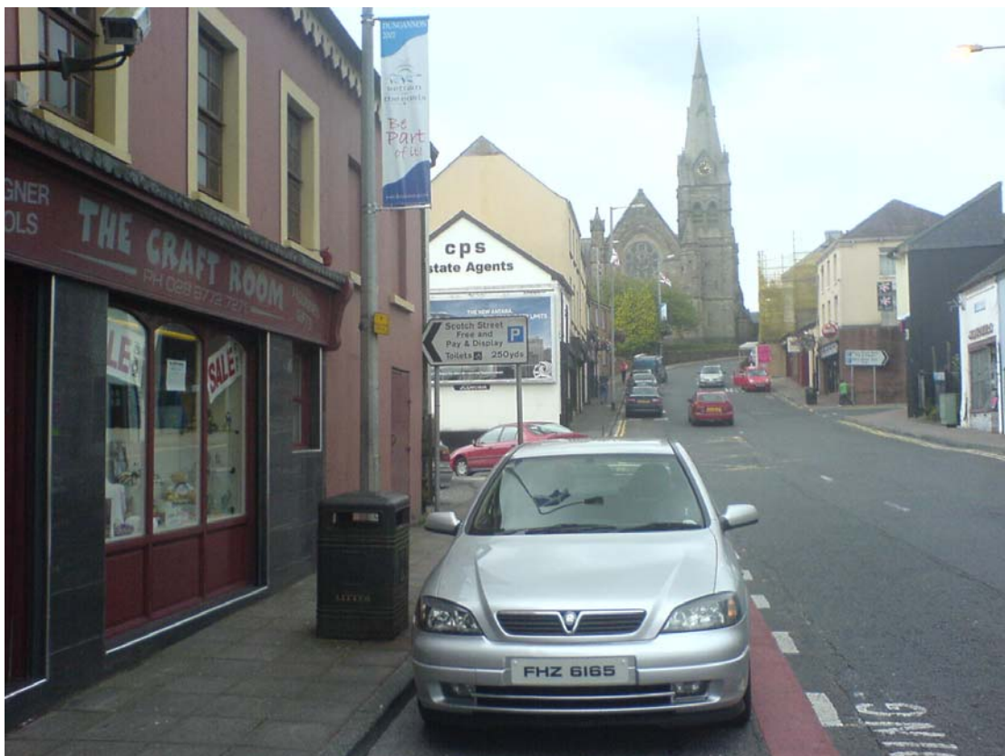
Appendix 3 – Location B. Perry Street Dungannon. (Tubes behind road-sign inner post)