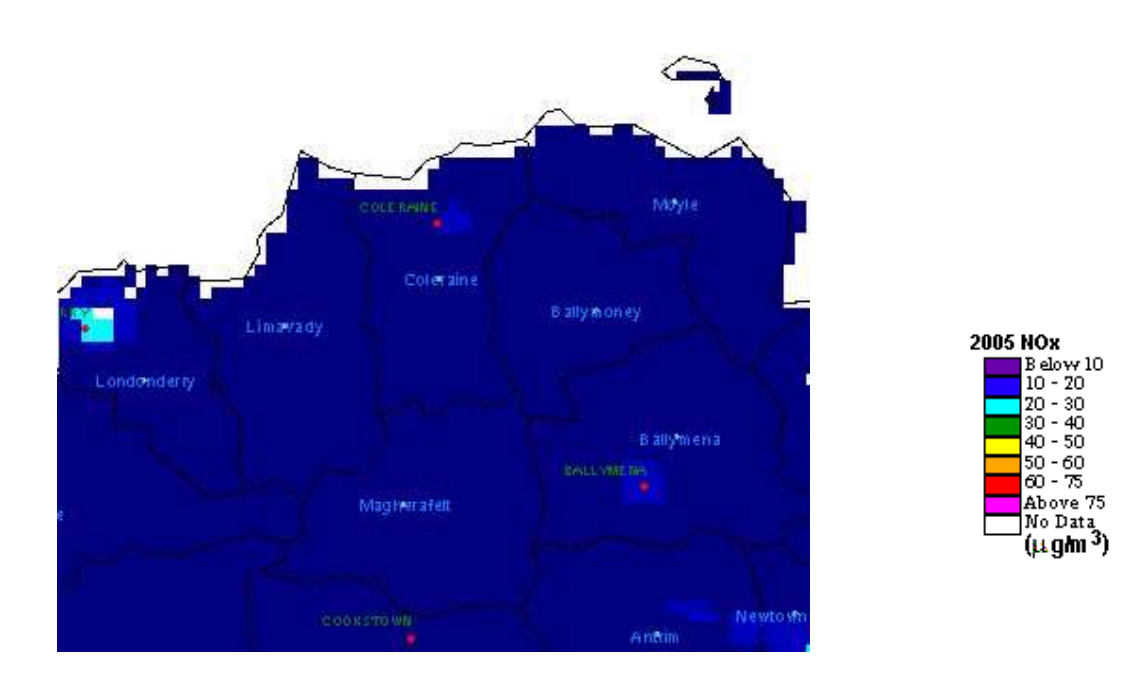
Figure 3.2 Background NO<sub>x</sub> concentrations 2005

Background concentrations were obtained for the Ballymoney area using the maps on the UK National Air Quality Information Archive web site <u>http://www.aeat.co.uk/netcen/airqual/home.html</u> (Figure 3.2).