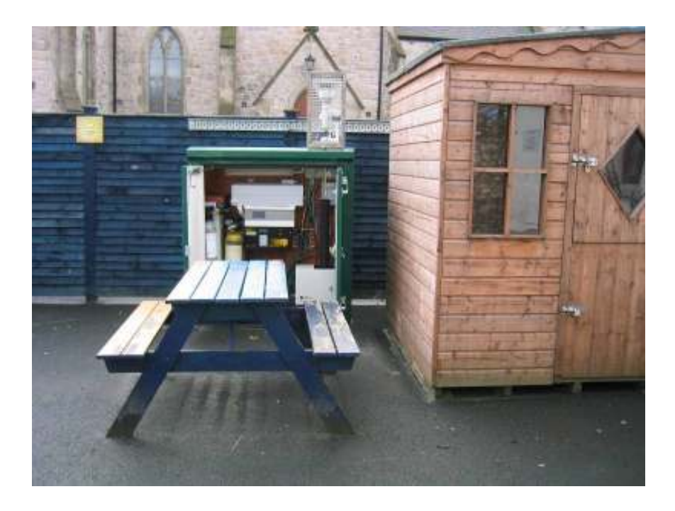
<u>Photograph 3 – Showing Real time monitoring equipment for SO2 and PM<sub>10</sub></u> <u>located at Gortalowry House, Cookstown.</u>