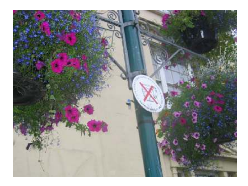
Photograph 1 – Showing NO<sub>2</sub> Monitoring Tube (Z1) Located at High Street, Moneymore