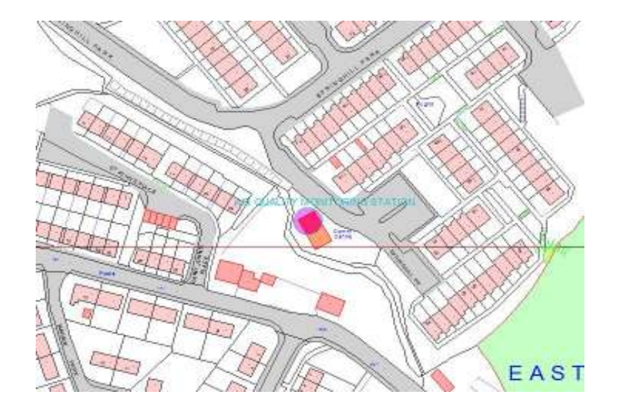
Figure 1 Location of the Springhill Park Monitoring Site

The automatic SO_2/PM_{10} monitors are co-located with an 8-port sampler which provides black smoke and sulphur dioxide data. The 8-port sampler has been in operation since 1999 and has recorded the highest black smoke levels in the UK in all years from 1999 to 2003. The monitoring results from the PM_{10} monitor are shown in Table 1 and Figure 2 for the calendar year of 2004.